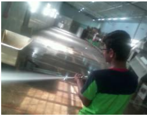
Performance after service by "PERFECT WATERJET SERVICE SOLUTIONS"- Chennai